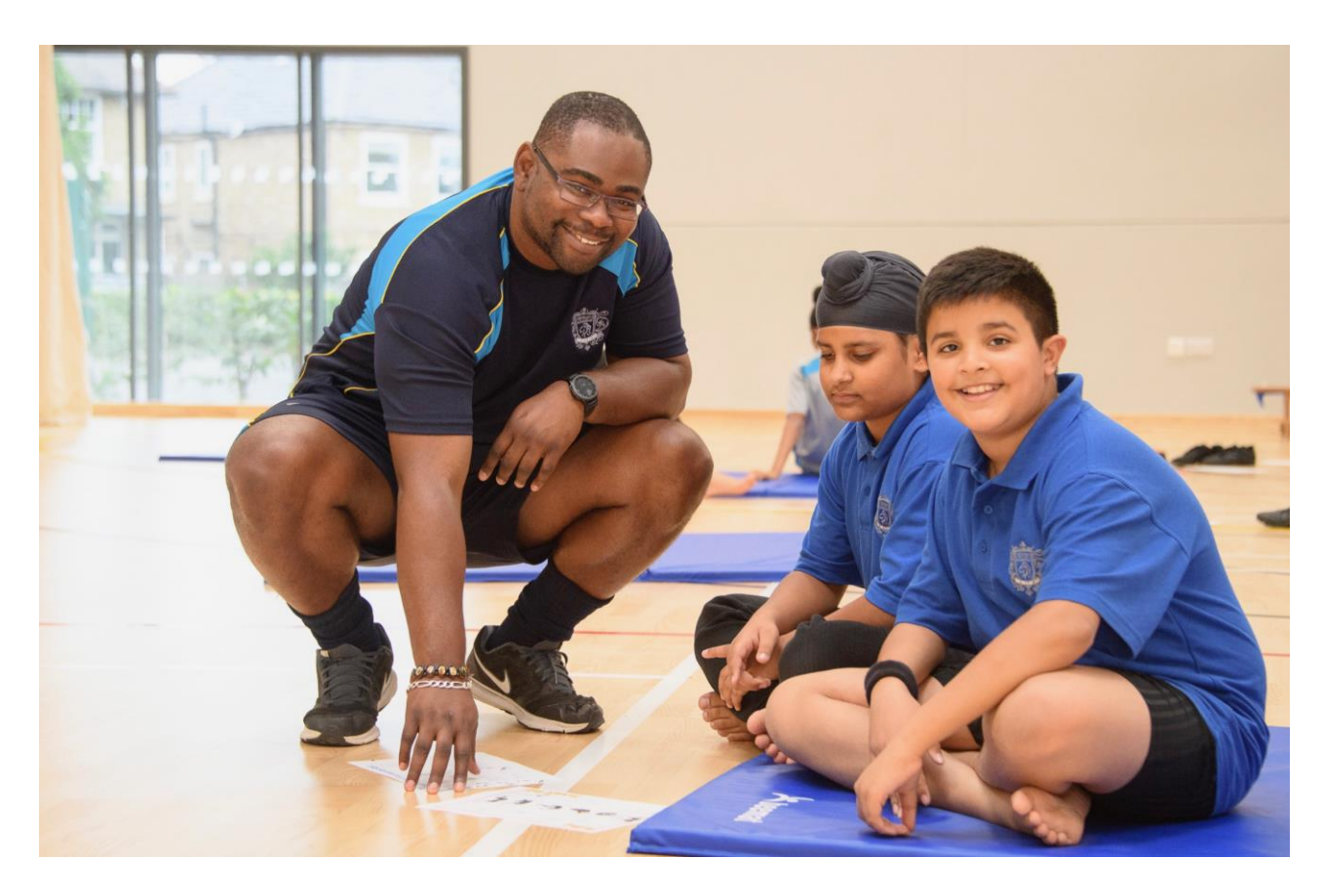
Applicants need to understand the context within which the school will operate. The following points highlight some of this context:

NSWL aims to improve educational attainment and broaden the curriculum to nurture spiritual and emotional wellbeing; promote family and faith virtues; and integrate families and community into education. The School also seeks to help to alleviate the shortage of school places and increase the diversity of education in Hounslow.