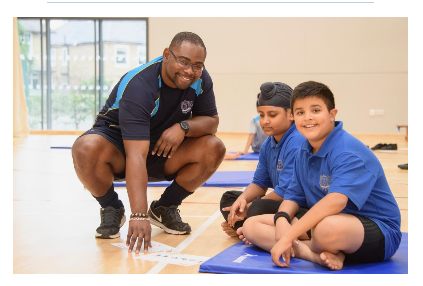
Applicants need to understand the context within which the school will operate. The following points highlight some of this context:

NSWL aims to improve educational attainment and broaden the curriculum to nurture spiritual and emotional wellbeing; promote family and faith virtues; and integrate families and community into education. The School also seeks to help to alleviate the shortage of school places and increase the diversity of education in Hounslow.